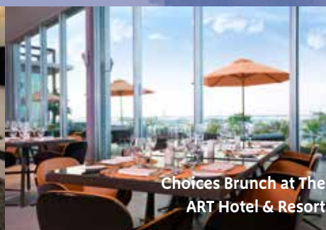
Choices Brunch at The ART Hotel & Resort