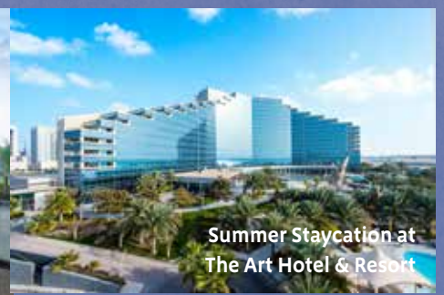
Summer Staycation at The Art Hotel & Resort