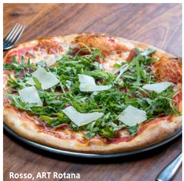
Rosso, ART Rotana