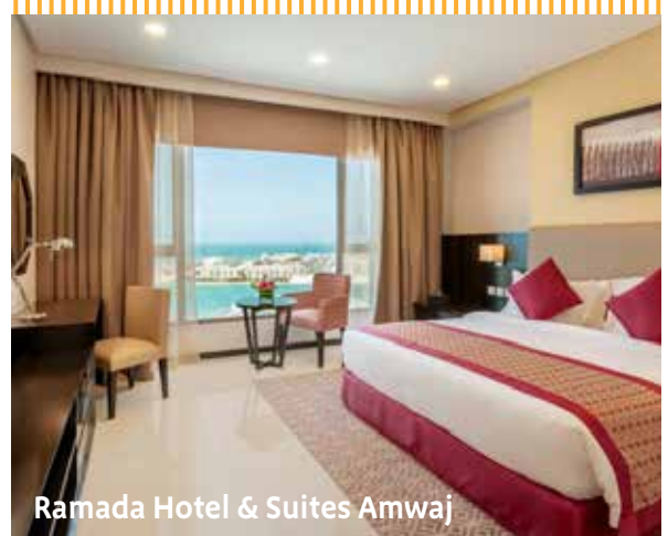
Ramada Hotel & Suites Amwaj

Staying with us is as safe as staying at home.